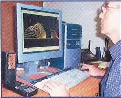
In-House Roll Tooling Design