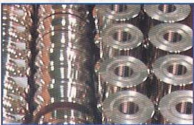
All Tooling is Re-cut after Heat Treat to Ensure Quality